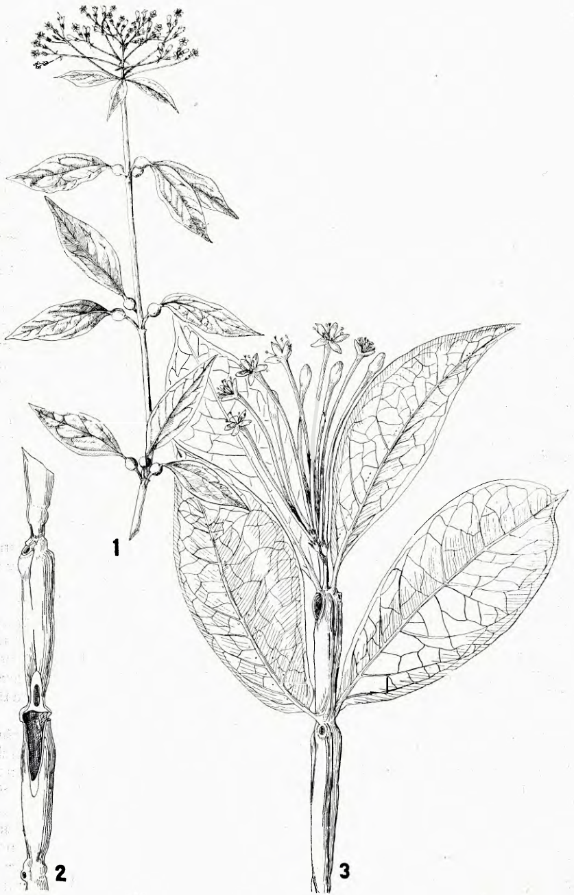
Plate 8 Myrmecophily in the Verbenaceae (See opposite page for details.)